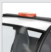
SECURITY LIGHT BAR