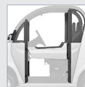
QUARTER HARD DOOR