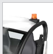
SECURITY LIGHT BEACON