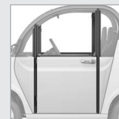
HALF HARD DOOR