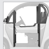
QUARTER HARD DOOR