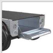
COVERED BED HINGED TAILGATE