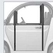
HALF HARD DOOR