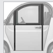
FULL HARD DOOR