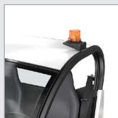
SECURITY LIGHT BEACON