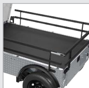
FOLD-DOWN STAKE SIDES