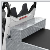
FRONT TOOL CHEST